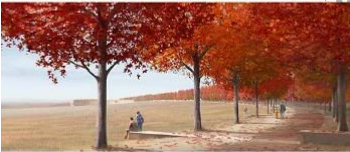
40 MEMORIAL GROVES Why then does the actual design only contain 38?

Stop the Memorial Blogburst: Why only 38 Memorial Groves? One prominently advertised feature of the Flight 93 TM crash site in Pennsylvania is the "40 Memorial Groves" for the 40 fallen heroes: