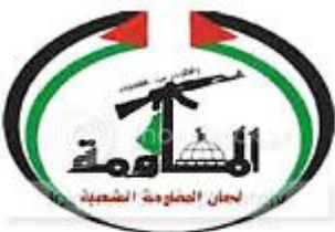
Popular Resistance Committees