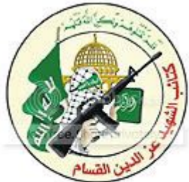
Ezzedein al-Qassam Brigades