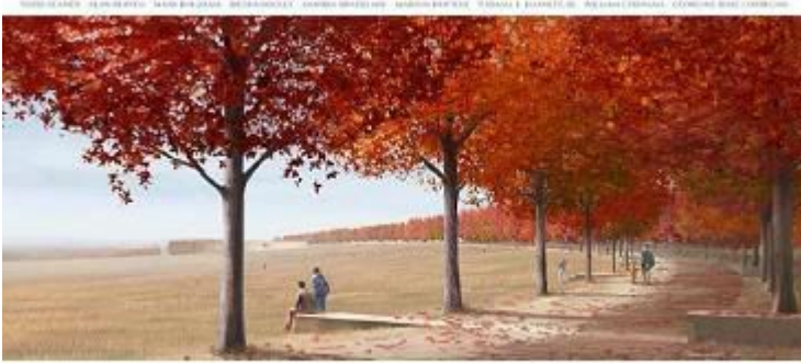
40 MEMORIAL GROVES